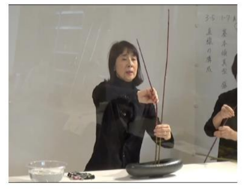
Text 3-5 Composition of Straight Lines 直線の構成

Members benefit: Free curriculum videos by Gaho ISONO STA会員特典:五十野雅峰本部講師によるテキスト動画をご覧いただけます!